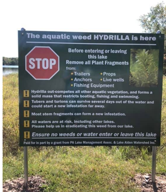
Signage to alert on the presence and prevention of AIS

Below you will find examples and resources for AIS prevention BMP's