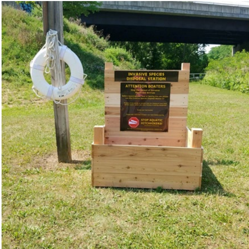
DIY Disposal Box

https://fingerlakesinvasives.org/aquatic-invasive-species-ais-disposal-station-instructions/